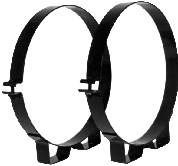
Most of our air cleaners with metal housings require two mounting bands.