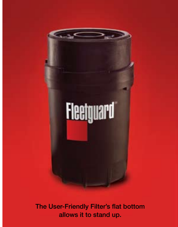
The User-Friendly Filter's flat bottom allows it to stand up.

Finally, there's a filter that's easy to spin on, easy to take off, and that won't tip over when you set it down. The user-friendly filter is designed to obsolete metal filters, with advanced polymer materials inside and out for superior performance with easier handling. Plus, because it's from Cummins Filtration – the industry's leading manufacturer of high-quality filtration products – you know that your engine is getting the best protection available.