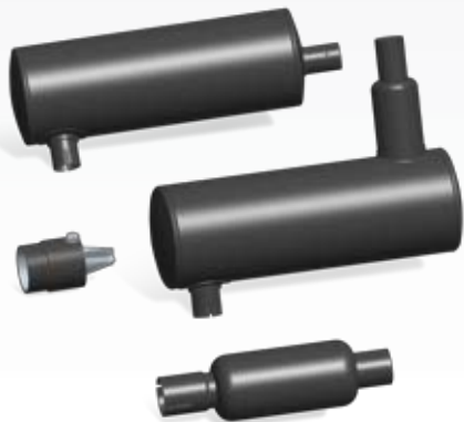
Complete System Solution

Cummins Filtration has a complete line of Fleetguard® standard off-highway exhaust products, which includes product coverage for engines in the 8 to 50 horsepower (6 to 37 kW) range. This extended product offering complements the larger off-highway standard muffler series which covers exhaust flows up to 2750 CFM (78 M 3 /min) and provides Industrial Grade (12-18 dBA sound reduction) silencing ratings.